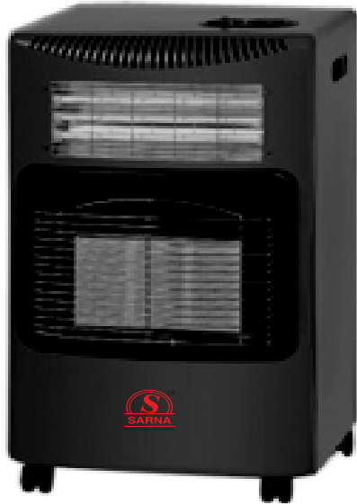
Gas Cum Electric Heater Double