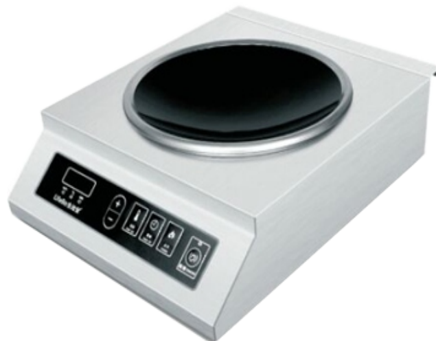
Model 3.5Kw ~ Price Wok ~ Rs. 23000/-