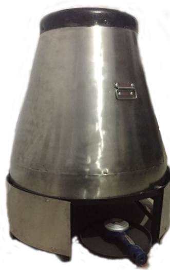
Round S/Steel Tandoor-Gas