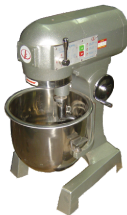
Spiral/Planetary Mixer -Imp