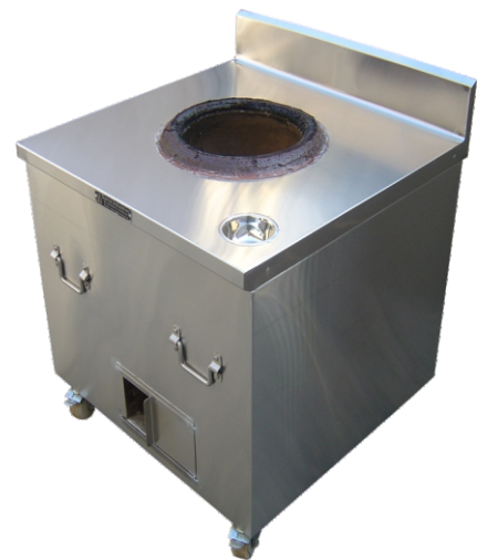
Square S/Steel Tandoor-Gas/Coal

Size ~ Prices 24*24*32 ~ Rupees 40000/- 30*30*32 ~ Rupees 44000/- 36*36*32 ~ Rupees 48000/-