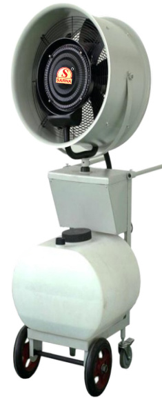
Misting Humidifier -Imported