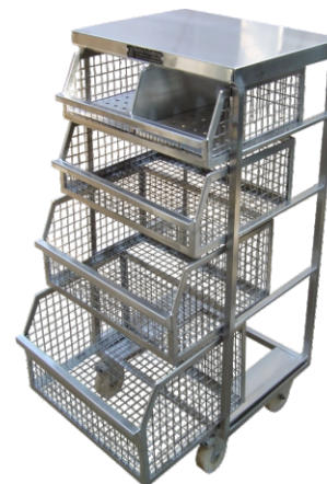
Chilly Ginger Garlic Storage Bin

Capacity ~ Price 2 HP ~ Rupees 18000/- 3 HP ~ Rupees 23000/-