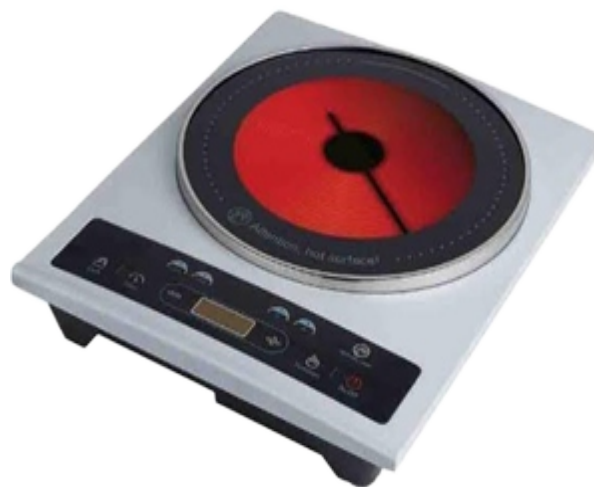
Model 2Kw ~ Price Infra Red I-20 ~ Rs. 5000/-