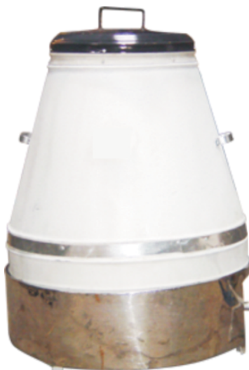
Round Metalic Tandoor-Gas