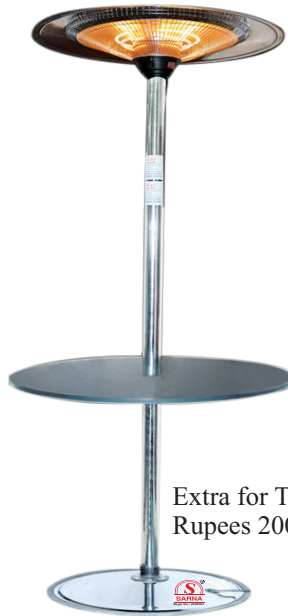
Electric Heater 3Kw-Indian