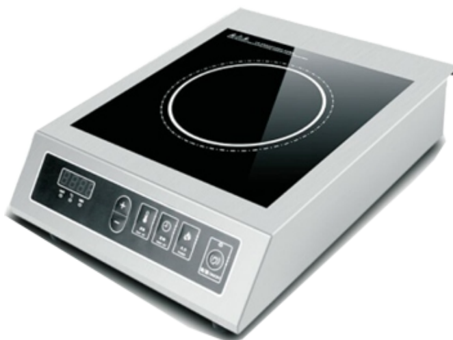
Model ~ Price C:125 3.5Kw ~ Rs. 18000/- C:140 5Kw ~ Rs. 21000/-