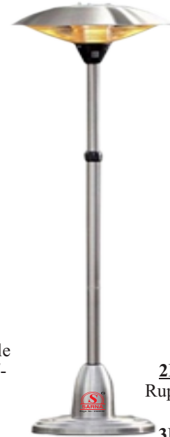
Electric Heater 3Kw-Imported