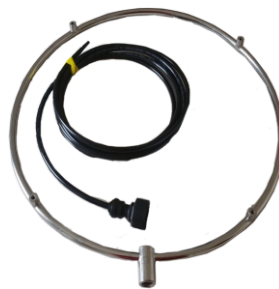
Ring & pipe

S/s Ring ~ Rupees 900/- Nylon Pipe ~ Rupees 120/-P/mtr