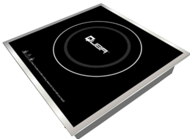
Model 5KW ~ Price Quba C:175 ~ Rs. 23000/-