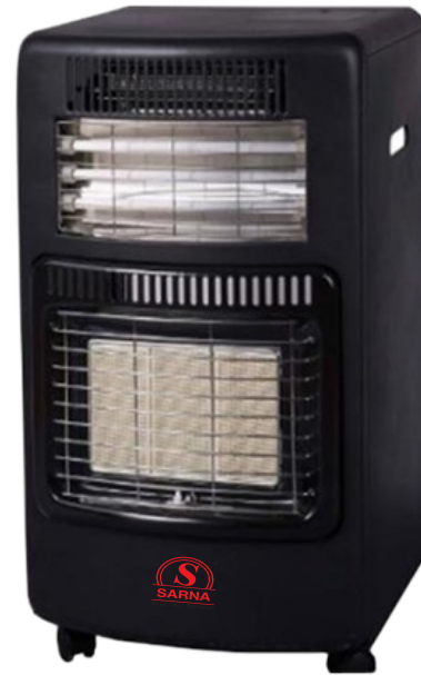
Gas + Electric+ Heat Air Blower Tripple