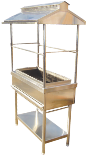
Bar Be Que with Canopy